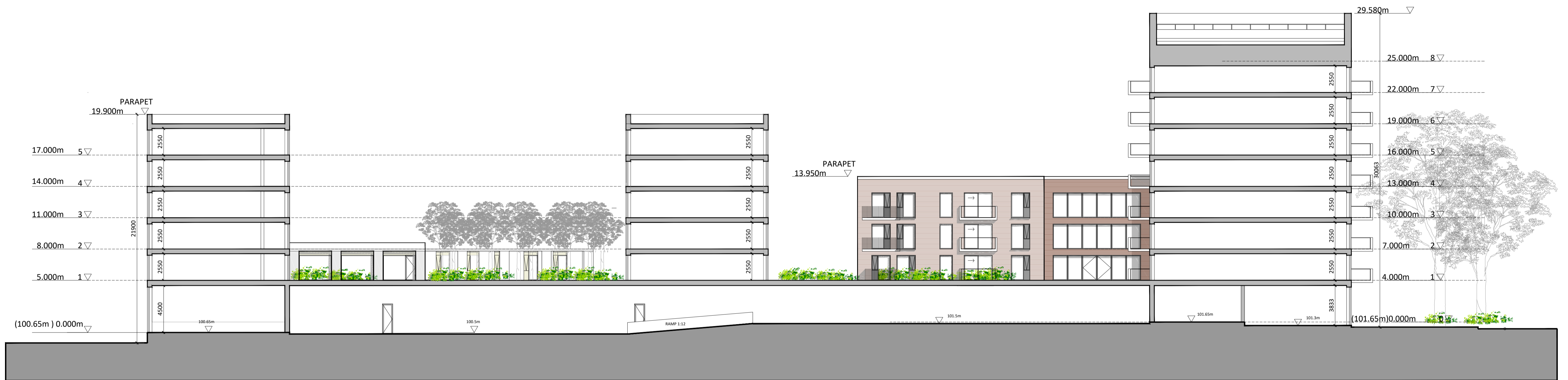
CONTEXTUAL ELEVATION SECTOR 2 - ELEVATION KK SCALE 1:200

SECTOR 2 + 3 - CONTEXTUAL ELEVATIONS: JJ + KK