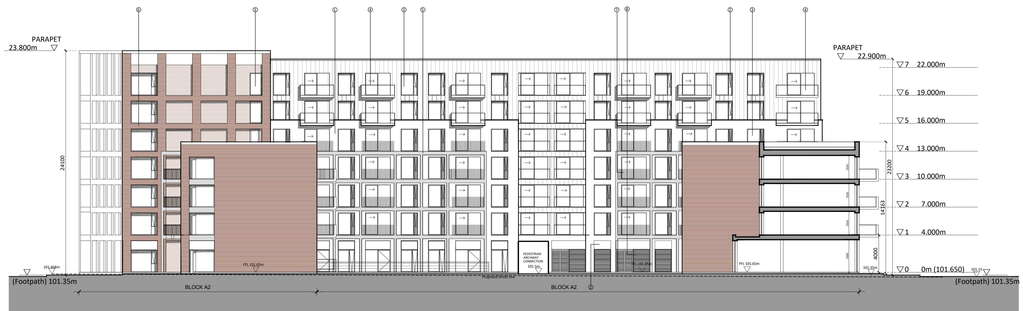
CONTEXTUAL ELEVATION SECTOR 1 - ELEVATION LL SCALE 1:200