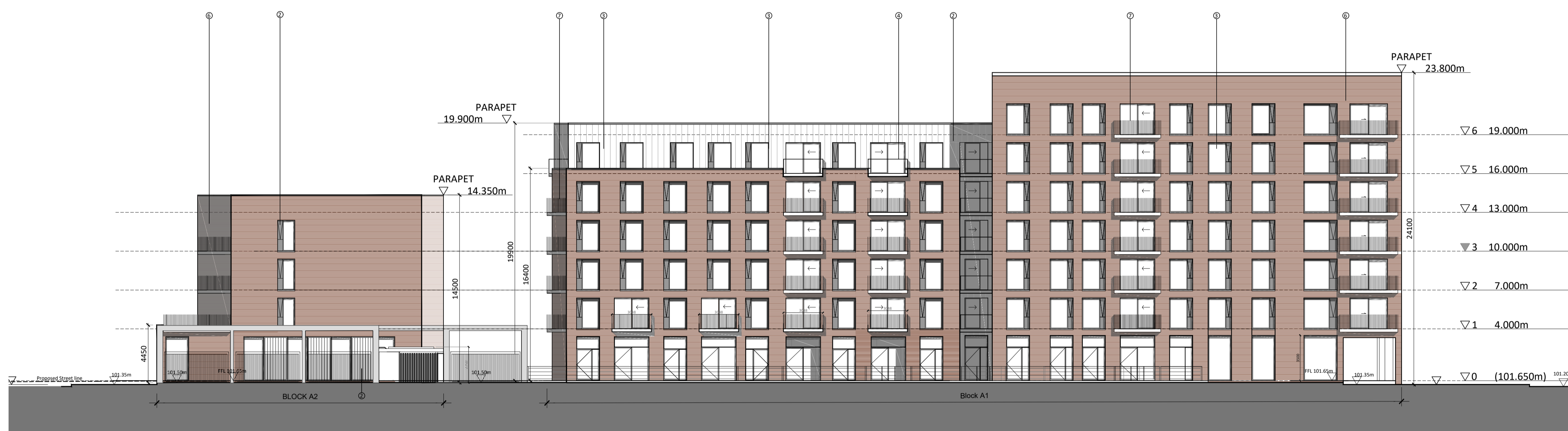
WEST CONTEXTUAL ELEVATION SECTOR 1 - ELEVATION FF SCALE 1:200