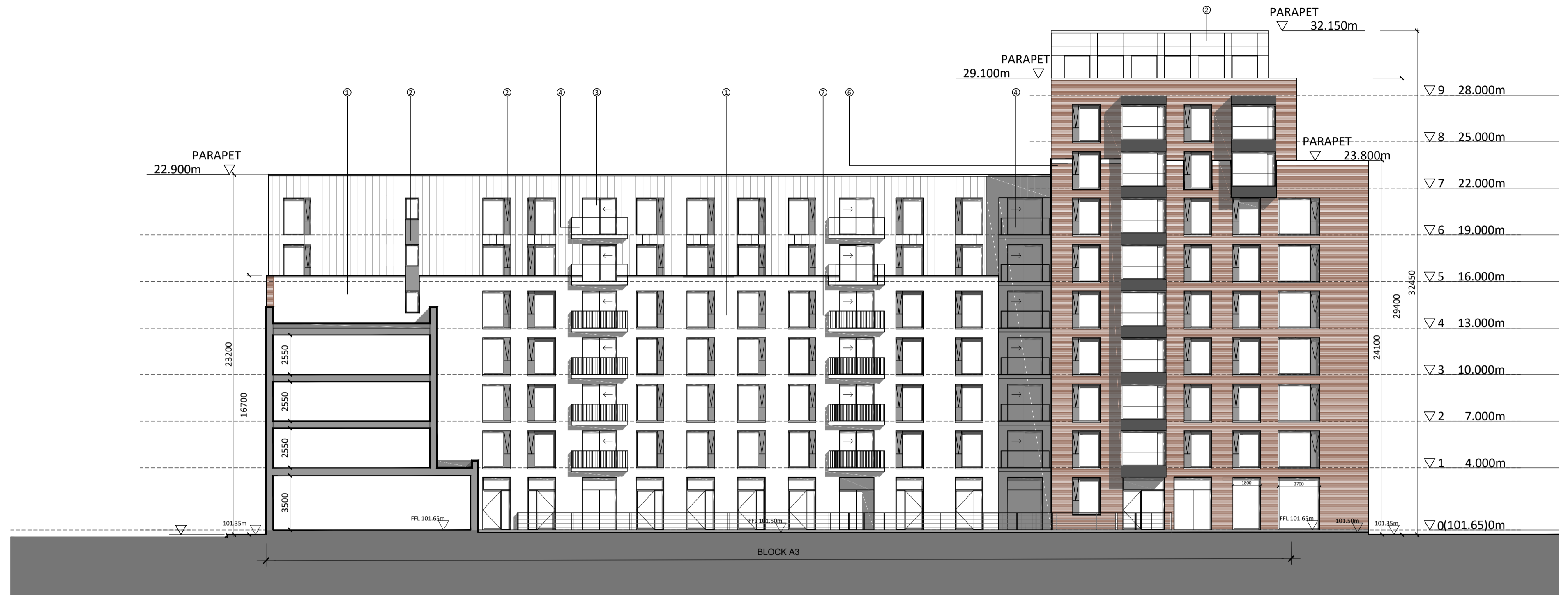
CONTEXTUAL ELEVATION SECTOR 1 - ELEVATION EE SCALE 1:200